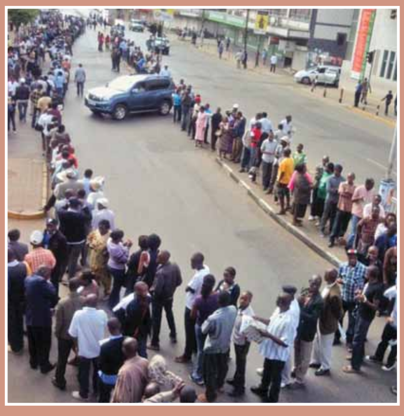
Voters queue at the Moi Avenue Primary School Polling Station in Nairobi County

Additionally, the tallying process started late in most counties and went on for hours, and in some instances, for days. This was primarily due to the slow transmission of results from the Constituencies. At the Multi Media University College, the Tallying Centre for the Langata Constituency, violence broke out when a returning officer