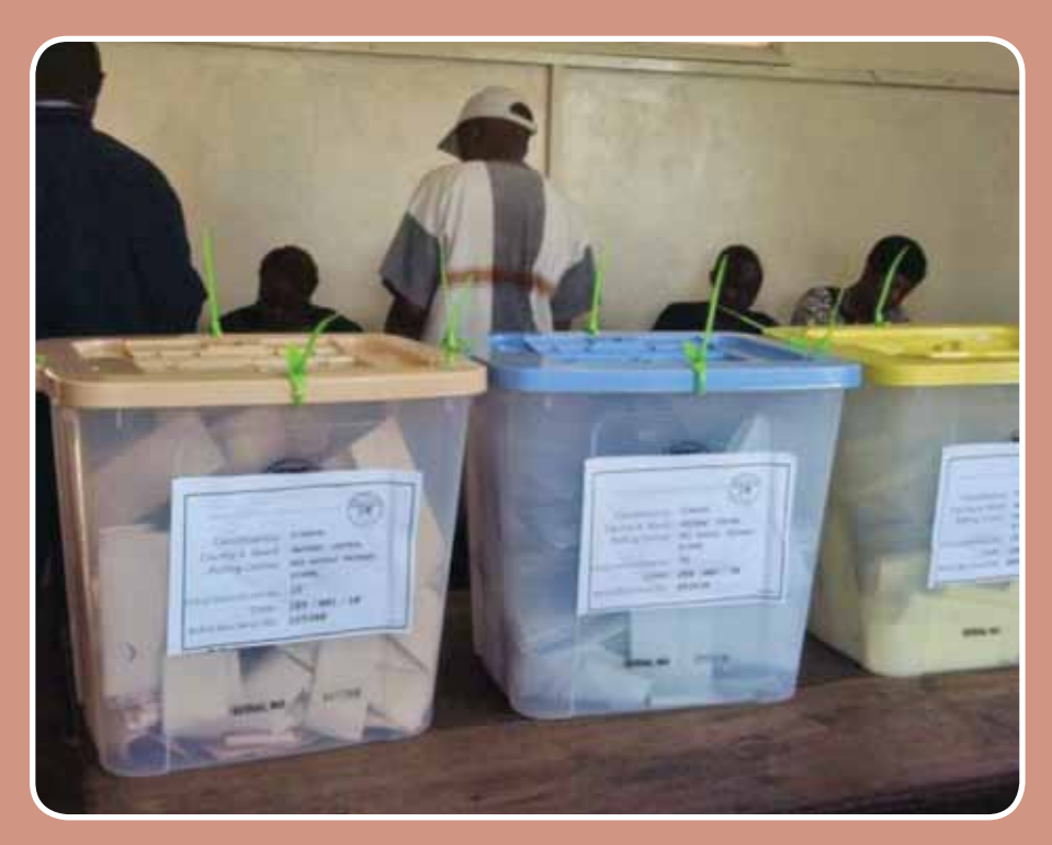
Voting process at Jamhuri High School Polling Station in Nairobi

2013 General Elections, the IEBC conducted a rigorous BVR exercise that was hoped would significantly improve the process and consequently, increase the acceptance of the results. The failure of the BVR Kits created suspicions of electoral fraud and raised questions regarding credibility of the results. The following are the findings on voting and the tallying processes.